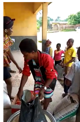
Distribution of food to the Orphans and Widows in IHUBE Community