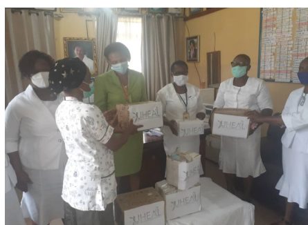
PPEs donation to Federal Medical Center Umuahia